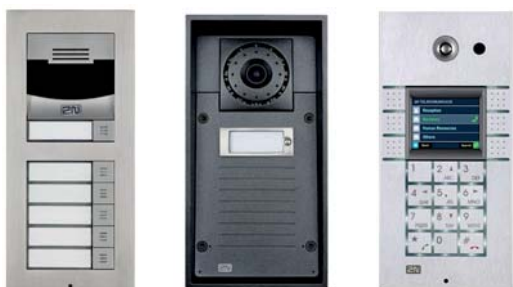
2N® Helios IP Verso